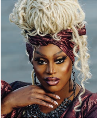
JOE MAC CREATIVE