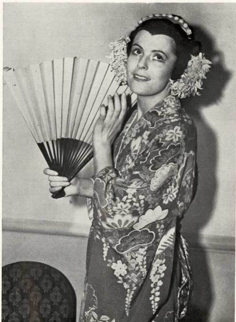
JARMILA NOVOTNA AS MADAMA BUTTERFLY ( Cho-Cho-San )